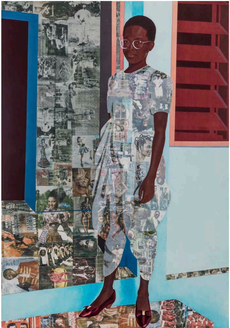
"The Beautiful Ones" Series #1c