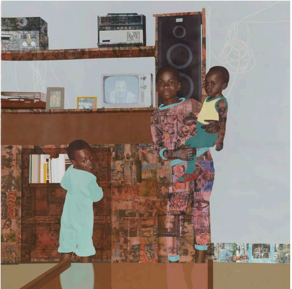
"The Beautiful Ones" Series #9