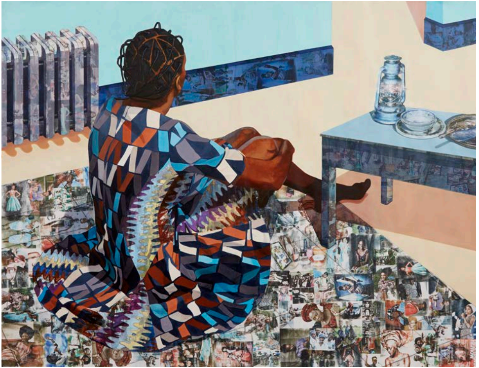
"The Beautiful Ones Are Not Yet Born" Might Not Hold True For Much Longer