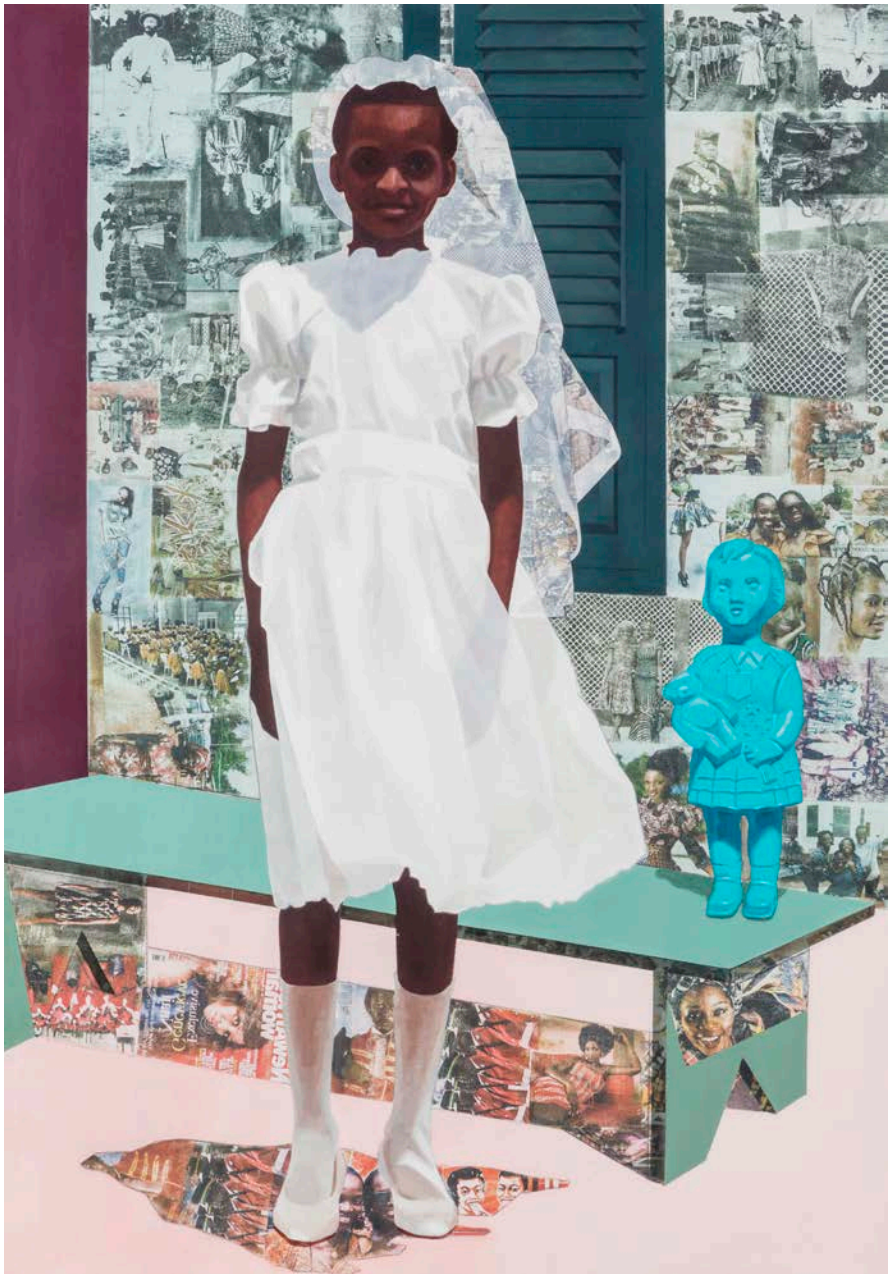
"The Beautiful Ones" Series #4