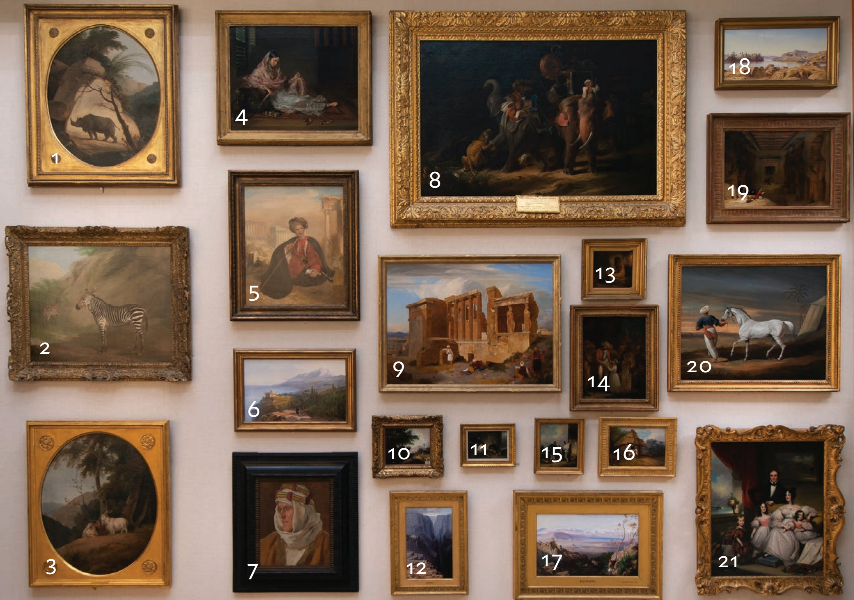
DOOR WALL / BAY E