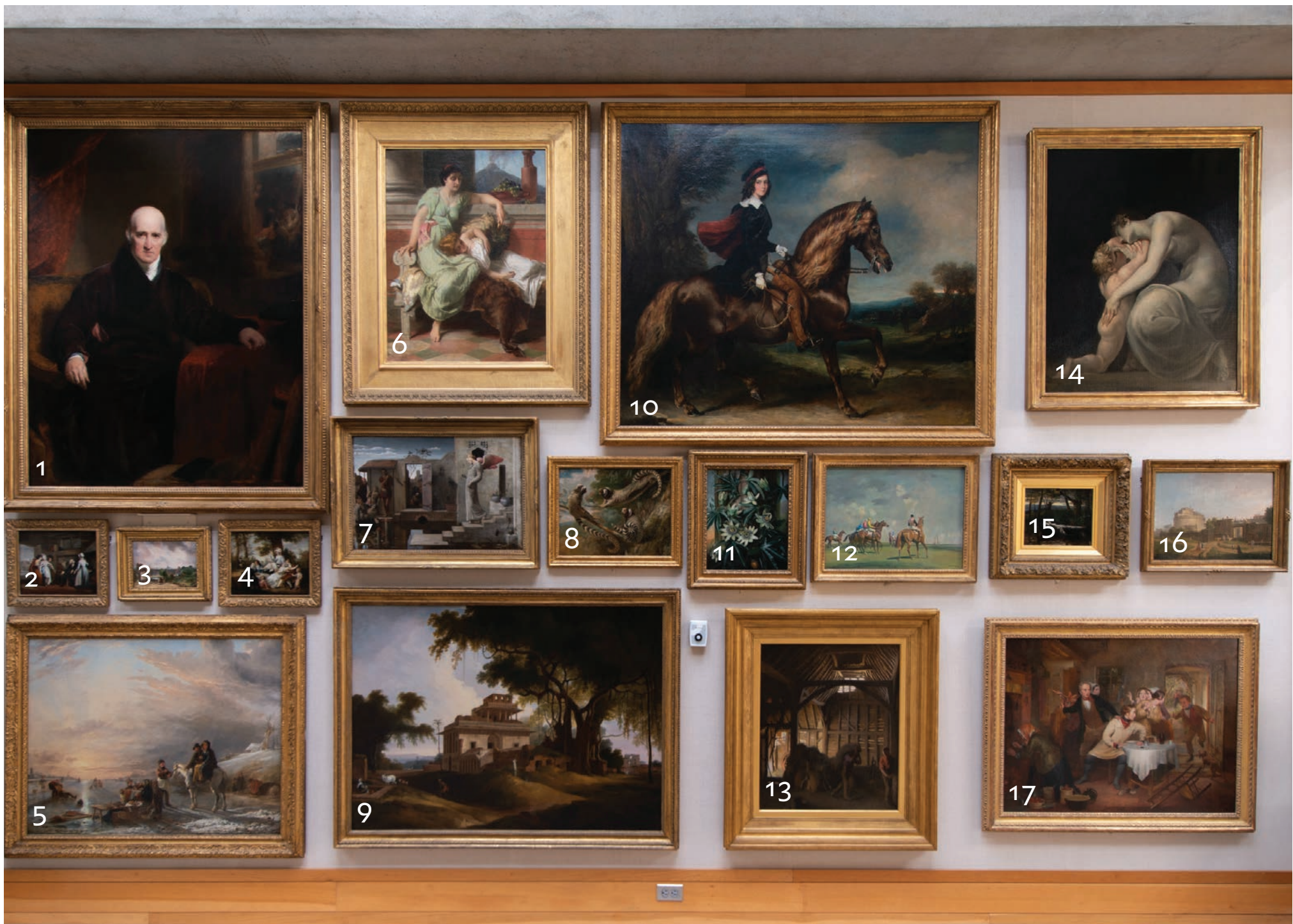
DOOR WALL / BAY C