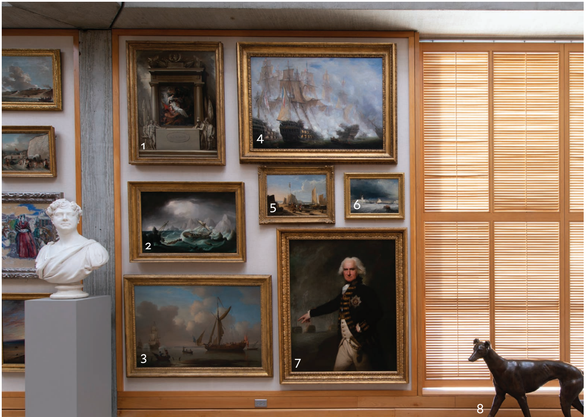
WINDOW WALL / BAY E