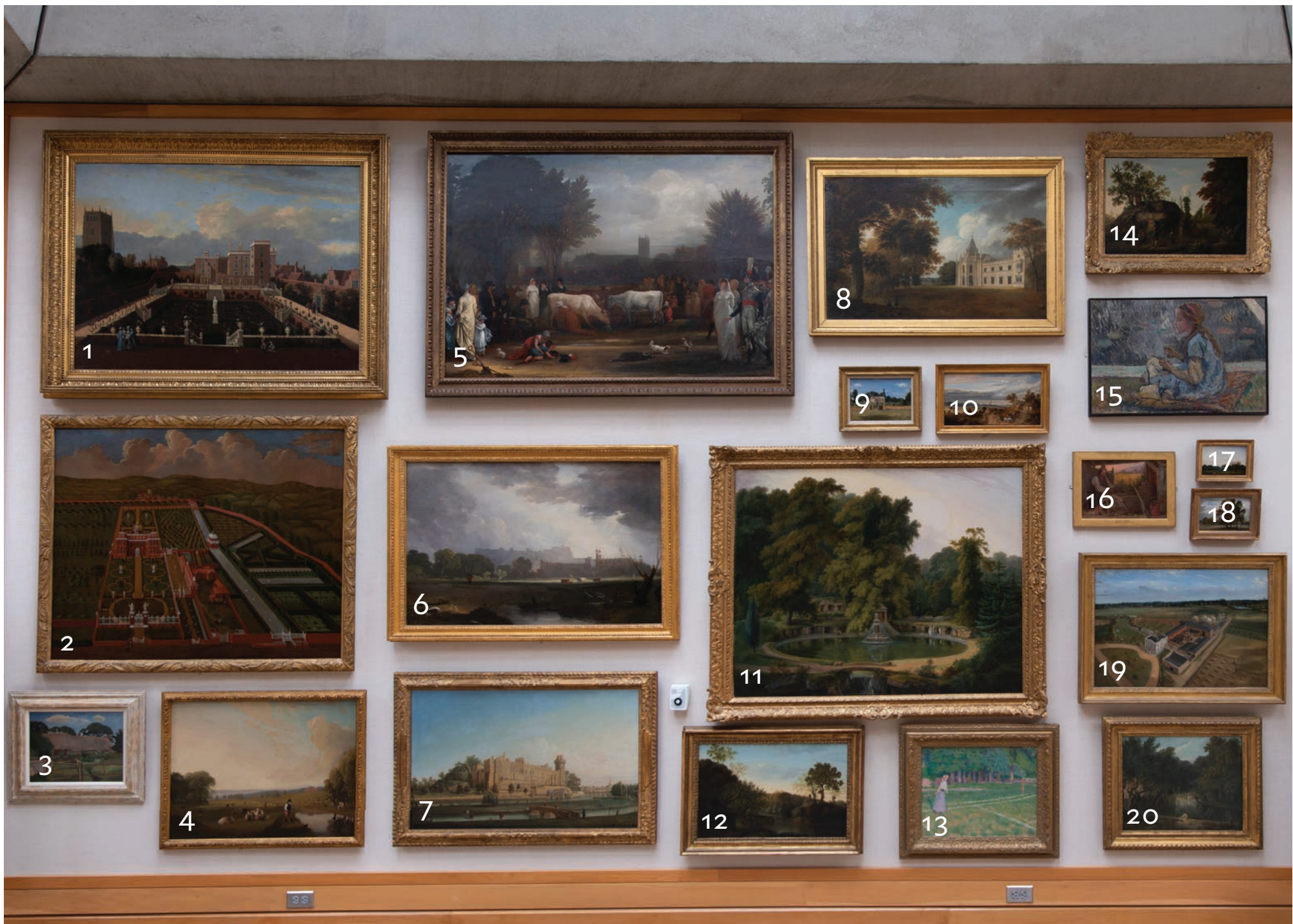
WINDOW WALL / BAY B