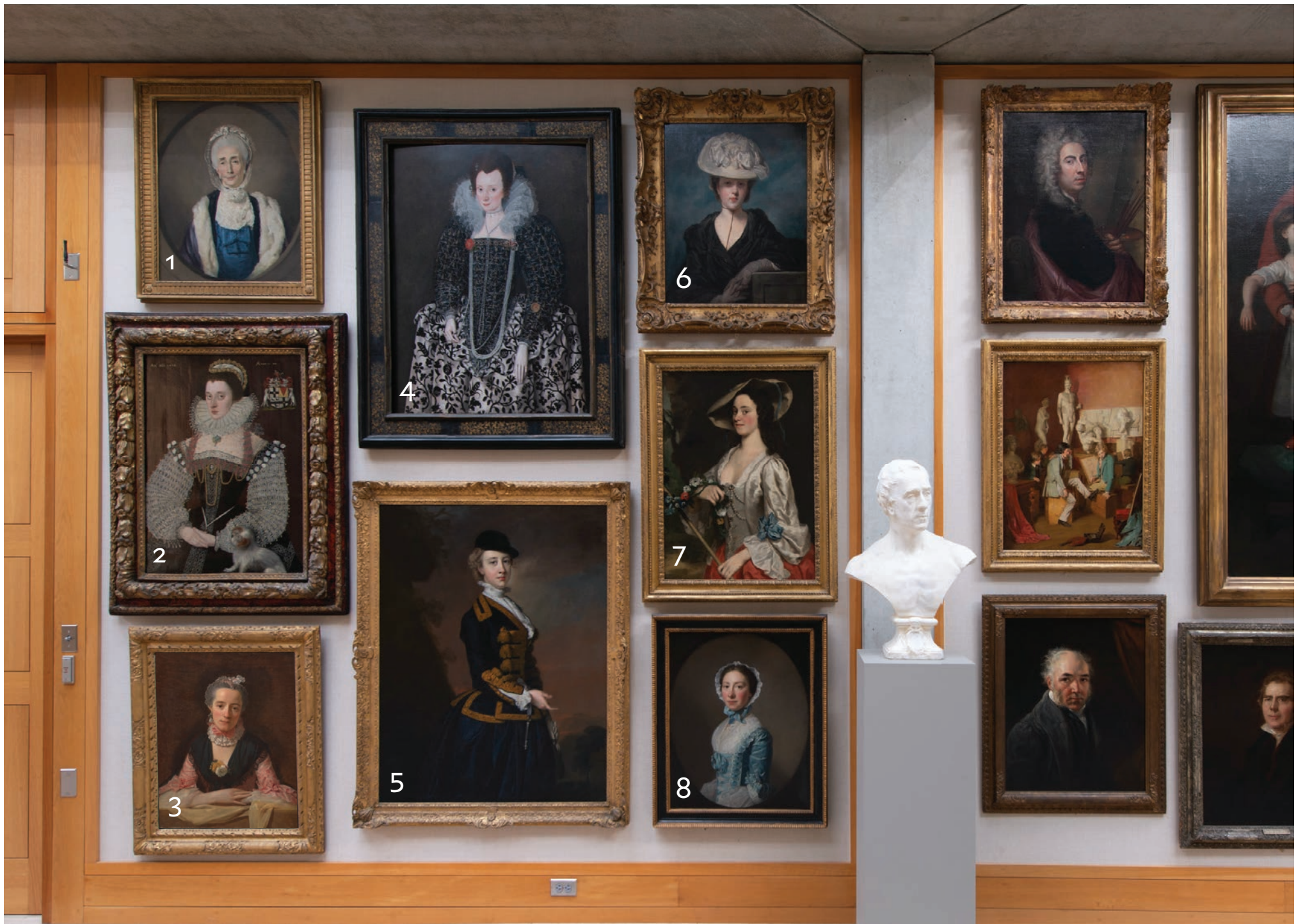
DOOR WALL / BAY A