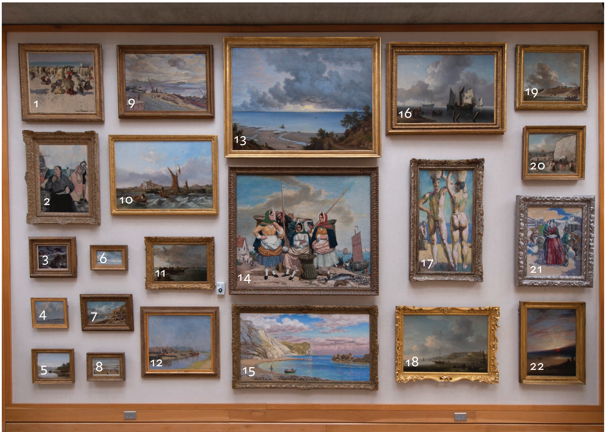
WINDOW WALL / BAY F