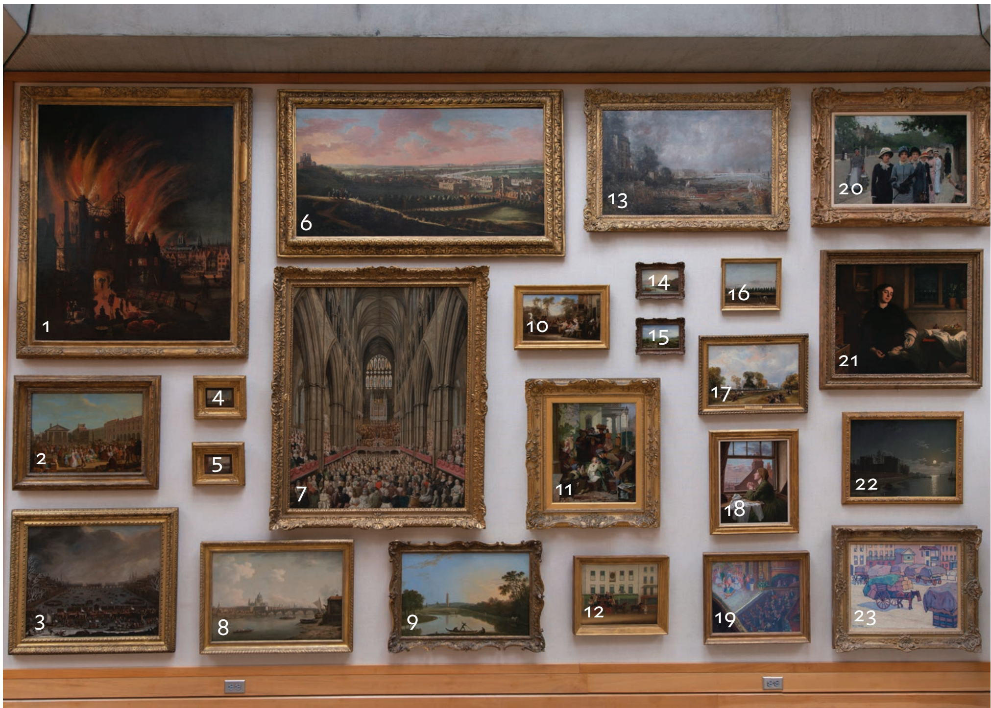
WINDOW WALL / BAY G