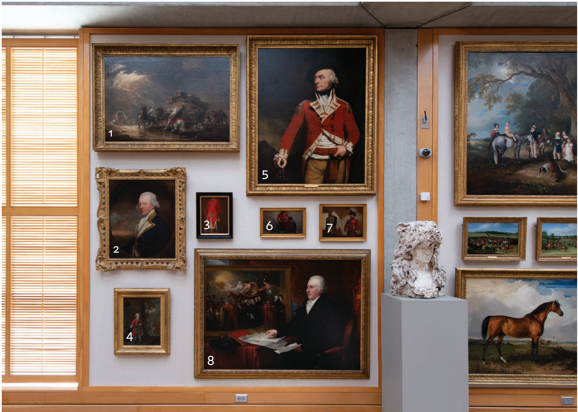
WINDOW WALL / BAY D