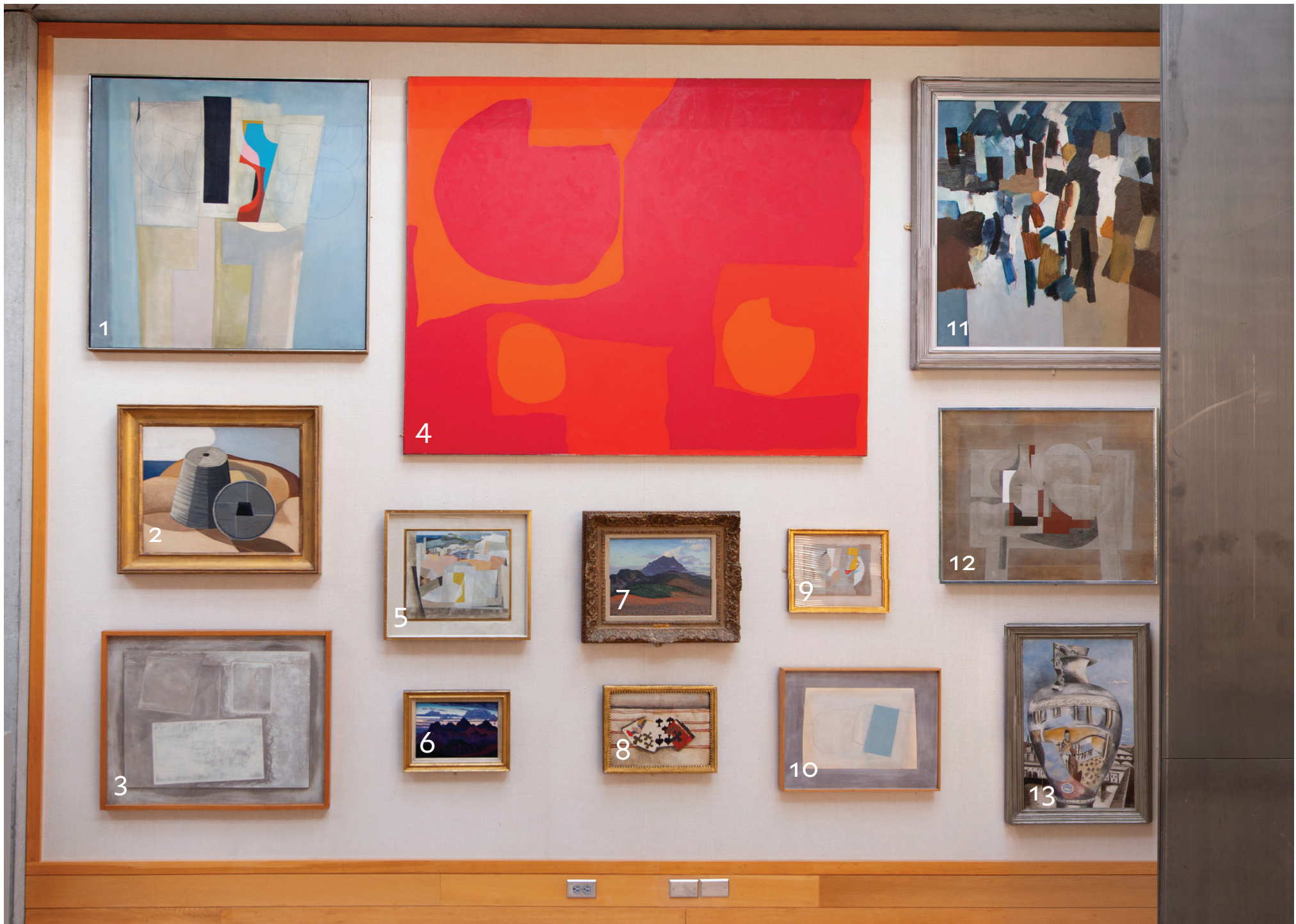
DOOR WALL / BAY D