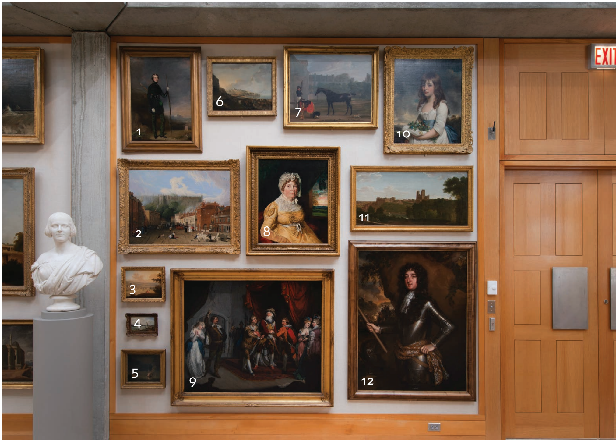
DOOR WALL / BAY G