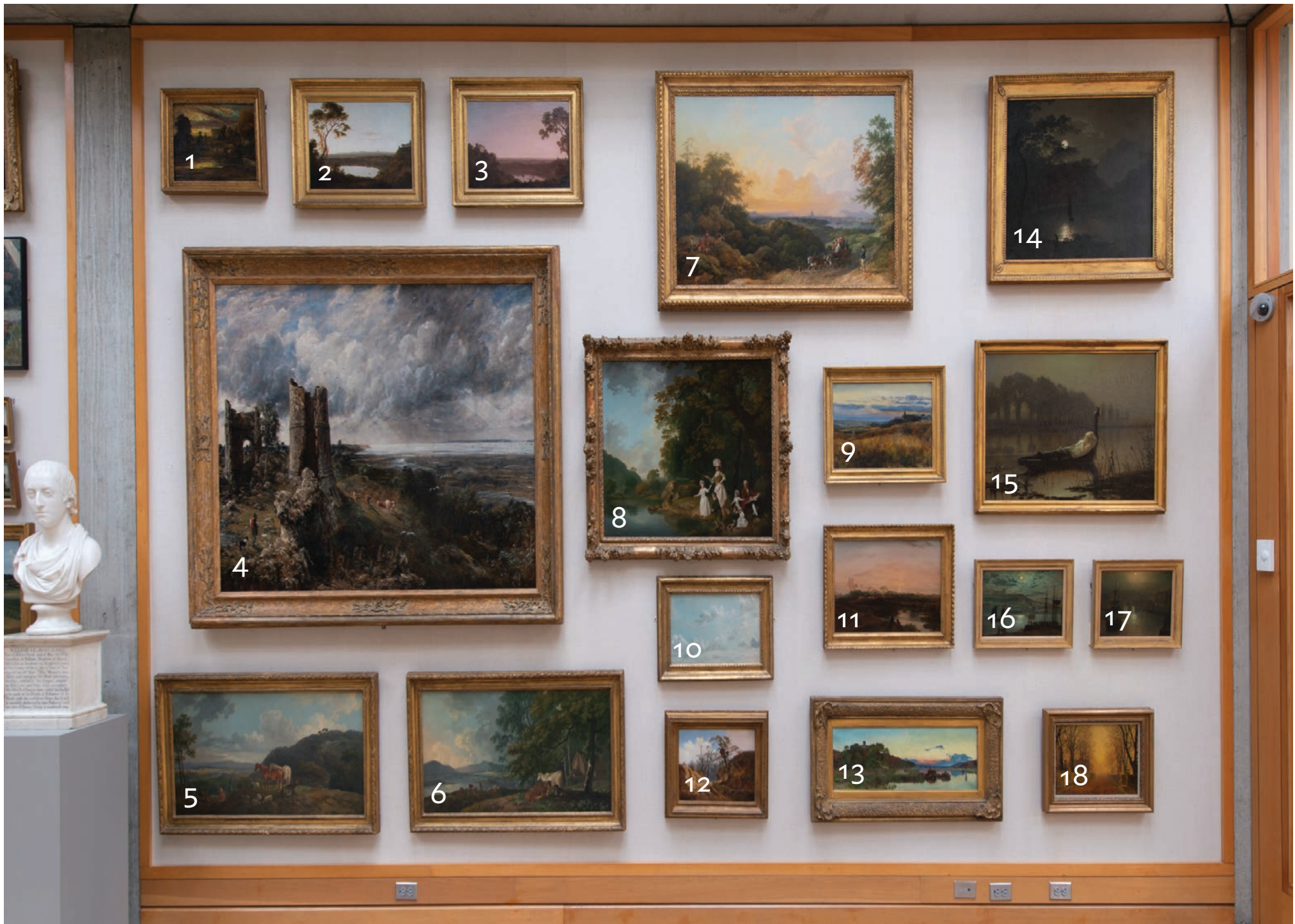
WINDOW WALL / BAY A